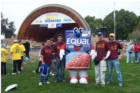
During Columbus Day weekend, four brothers made it to the annual American Diabetes Association Walk for Diabetes.

Our chapter participated in the annual Walk for Diabetes to support the American Diabetes Association, whose goal is to find a cure for this disease. Diabetes has affected several members of our families and this was a major reason for the moral and monetary support from our chapter.