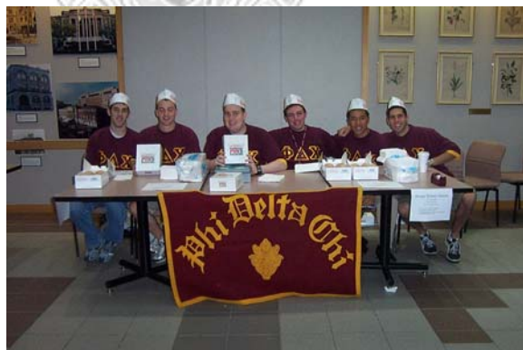
The Eta boys consider giving up pharmacy to pursue a life of donuts and coffee.

When the brothers of ETA chapter found out that Krispy Kreme was being built only 20 minutes away in Medford, Massachusetts we knew that it would be a great fundraiser. People wait hours just to get there hands on one of those deep fat fried, sugar glazed circles. With just 200 calories per donut and 13mg of cholesterol-who could resist! On September 11 th and October 23 rd we purchased 600 doughnuts as a fundraiser and sold out in just less than three hours. The money raised was donated to PDC's national charity St. Jude's Children Hospital in Tennessee, the Mission Hill Walk for Health, and the Leukemia/Lymphoma Society Walk for a Cure.