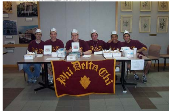
The Eta boys consider giving up pharmacy to pursue a life of donuts and coffee.

When the brothers of ETA chapter found out that Krispy Kreme was being built only 20 minutes away in Medford, Massachusetts we knew that it would be a great fundraiser. People wait hours just to get there hands on one of those deep fat fried, sugar glazed circles. With just 200 calories per donut and 13mg of cholesterol-who could resist! On September 11 th and October 23 rd we purchased 600 doughnuts as a fundraiser and sold out in just less than three hours. The money raised was donated to PDC's national charity St. Jude's Children Hospital in Tennessee, the Mission Hill Walk for Health, and the Leukemia/Lymphoma Society Walk for a Cure.